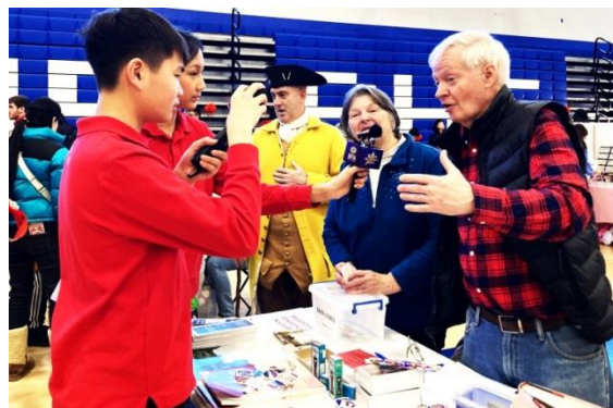
Society members learn about Chinese items while working the booth